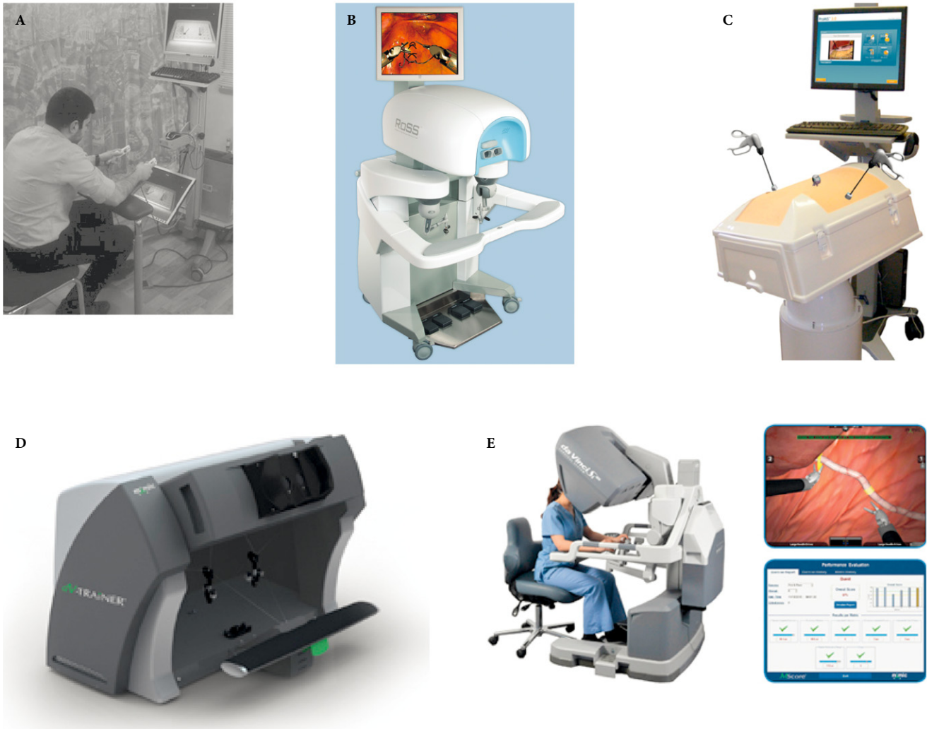
Fig. 4 Images of the VR robotic simulators. A , SEP [18]; B , RoSS [38]; C , ProMIS [39]; D , MdVT [40]; E , dVSS [41].