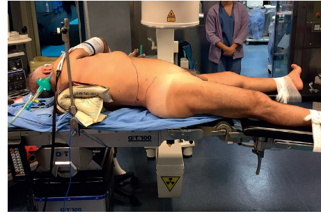
FIGURE 1: Patient's position on the operating table.

In the CT (computed tomography) study, the mean stone size was 2.2 cm. The stones were positioned in the renal pelvis (48.8%), in the inferior calyx (22.2%), and in the medium calyx (8.8%). No staghorn stones were documented. In 9 cases, we treated multicalyceal stones (20%). In these 9 cases, we preferred not to perform a secondary access but a combined antero- and retrograde procedure using a flexible ureteroscope. When possible, the stone was relocated in a place where lithotripsy could be performed through the percutaneous access; when this maneuver was not feasible, the stone was shattered using laser energy.