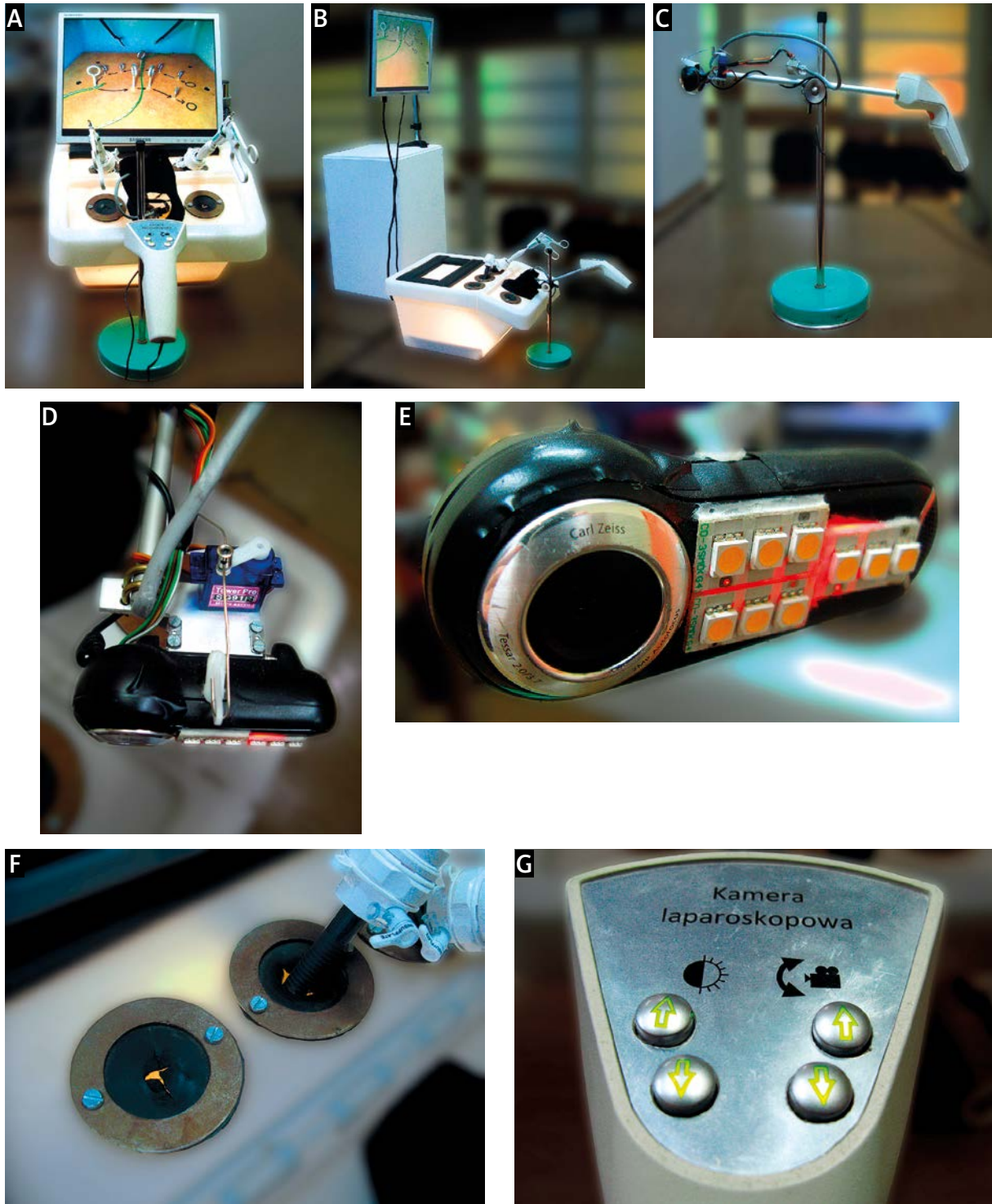
Photo 2. Webcam-based laparoscopic simulator. A, B – Simulator, C – camera placed in a stand, D – connection between an aluminum pipe and the webcam through servo, E – webcam with LEDs placed on its casing, F – holes for the trocars, G – the control panel